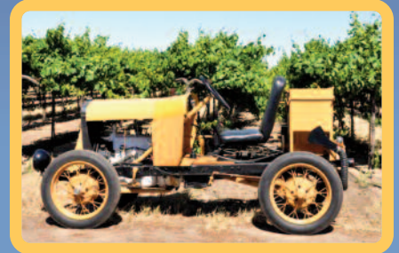
$250 1928 Model A Ford Sulfur Machine

SPONSORSHIP INCLUDES: 4 tickets to the event and recognition