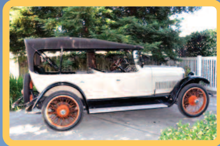
$500 1920 Nash Touring Car

SPONSORSHIP INCLUDES: 6 tickets to the event and recognition