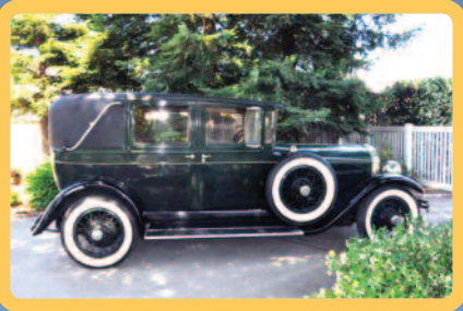
$1,000 1927 8-80 Locomobile

SPONSORSHIP INCLUDES: 6 tickets to the event and recognition